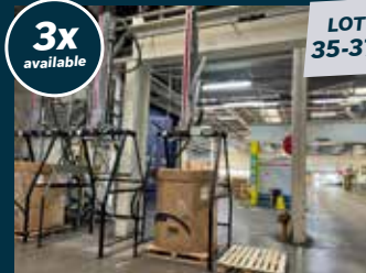
3x available LOT 35-37