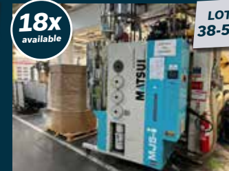
18x available LOT 38-55