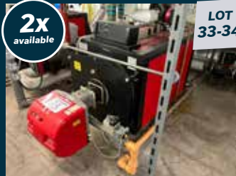
2x available LOT 33-34