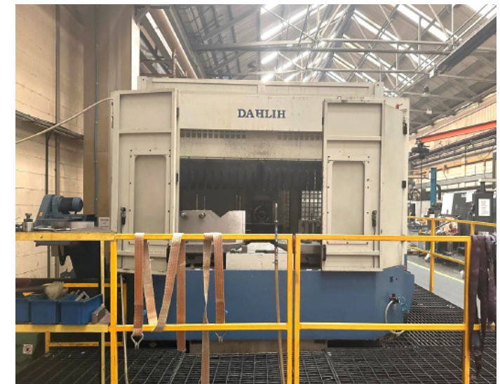
Lot 15: DAHLIH MCH800 Twin Pallet Horizontal Machining Centre with Fanuc Series 0i-MD Control (2012)

Phase 1 - Lots can be purchased and released immediately. Phase 2 - Lots can be purchased immediately but only released in February, 2025.