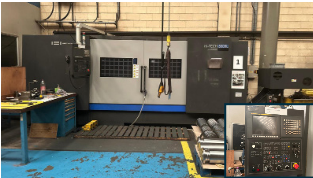
Lot 9: HWACHEON Hi-Tec 550BL CNC Lathe with Fanuc Series 0i-TD Control (2011)