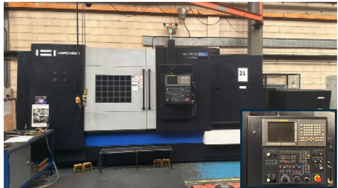
Lot 12: HWACHEON Hi-Tec 700 CNC Lathe with Fanuc Series 0i-TD Control (2019)

Viewing on site will be available by appointment only with the auctioneers Visiting parties will need to wear Personal Protective Equipment (PPE) No minors will be allowed on site. For further enquiries and prices, contact our Manchester office 0161 345 3000