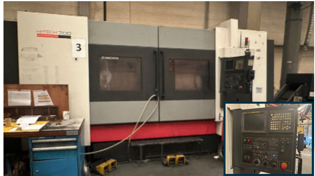
Lot 10: HWACHEON Hi-Tec 700 CNC Lathe with Fanuc Series 18i-TB Control (2008)