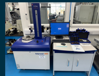
Lot 15: TAYLOR HOBSON Talyrond 385 Automatic Measuring Machine