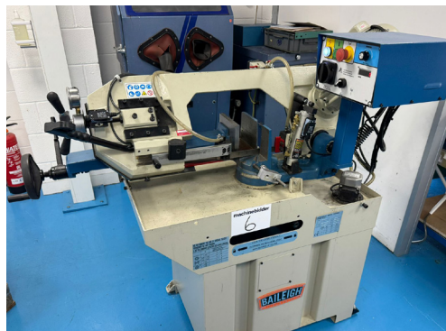
Lot 6: BAILEIGH Model BS-250M Horizontal Bandsaw. Year 2021