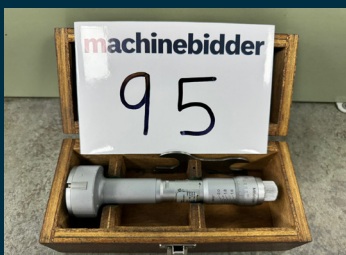
Lot 95: MITUTOYO 3 Point Bore Gauge. Capacity 1.6" - 2" in fitted case