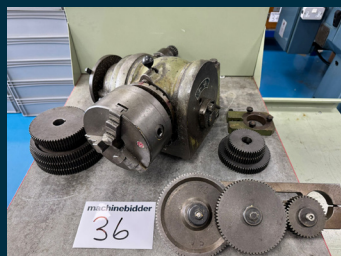
Lot 36: ASTRA Universal Precision Dividing Head 5" Centre Height