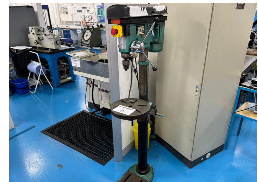
Lot 8: MEDDINGS Pedestal Drill