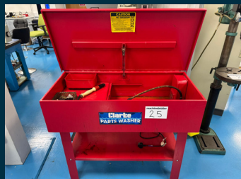
Lot 25: CLARKE Parts Washer