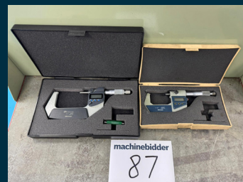
Lot 87: MITUTOYO Outside Digital Micrometers in fitted cases. 1"-2" & 2"-3"