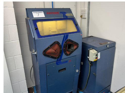
Lot 7: GUYSON Model Euro 2SF Shotblast Cabinet with Extraction Unit. Year 1998