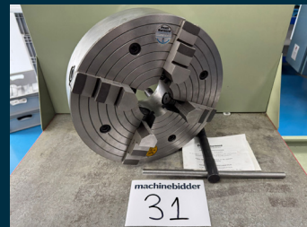
Lot 31: Unused 315mm dia. PRATT BURNER 4 Jaw Chuck Camlock D1-6