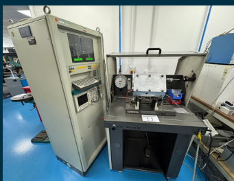
Lot 11: SCHENCK Balancing Machine with CAB 690 Control Unit. Year 2000