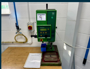
Lot 9: MICROTAP G2 Tapping Machine