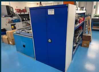
Lot 17: BOTT 2 Door Storage Cabinet