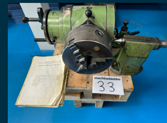
Lot 33: ASTRA Universal Precision Dividing Head 178mm centre height