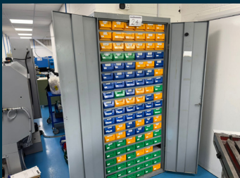
Lot 24: 2 Door Storage Cabinet with 113 Lin Bins Drawers