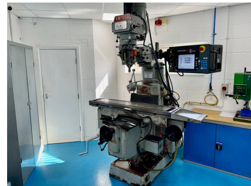
Lot 3: XYZ SM SLV3000 CNC Milling Machine with ProtoTrak SM Control