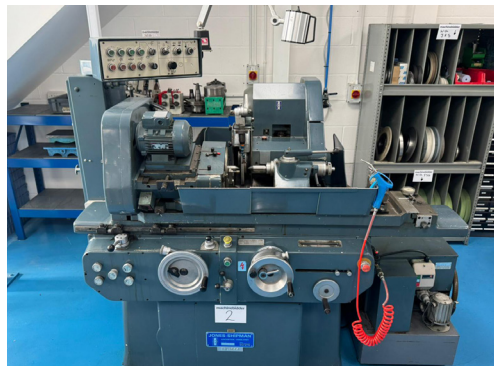
Lot 2: JONES & SHIPMAN Model 1074 Universal Production Cylindrical Grinder. Year 1977