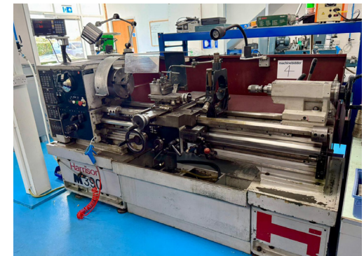
Lot 4: HARRISON M390 x 1250mm Between Centres Gap Bed Centre Lathe. Year 2000