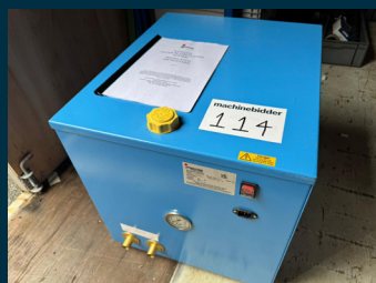
Lot 114: FLEXICOOL Air Blast Cooler. Serial No. R2957/1. Year 2022