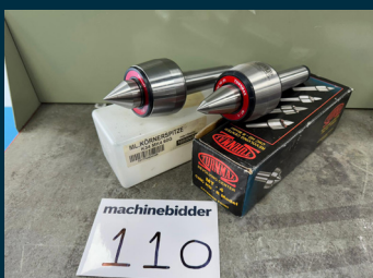
Lot 110: 2 x Unused 4MT Revolving Centres