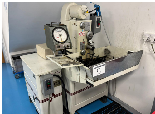
Lot 5: SUNNEN Model MBB-1660-CH Horizontal Precision Honing Machine