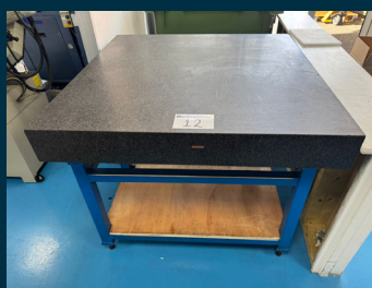
Lot 12: Granite Inspection Table 1205mm x 1205mm x 950mm High