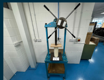
Lot 14: MARLCO Vertical Arbor Press on steel stand