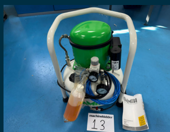
Lot 13: BAMBI BB15V - 240 Silent Compressor. 8 Bar 240 Volt