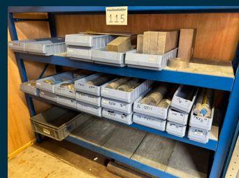
Lot 115: Qty of Aluminium Barstock inc Round Bar, Square bar etc (RACKING NOT INCLUDED)