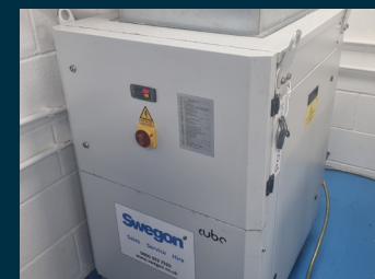
Lot 121: RPS COOLING LTD Refrigeration Unit. Year 2017

Items can be viewed on Monday 20th October, 2025 at the works at Unit 6 Holes Bay Business Park, Sterte Avenue, Poole, Dorset BH15 2AA between 9.30am - 3.30pm. All visitors will need to wear Personal Protection Equipment (PPE). No minors are allowed on site.