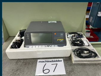
Lot 67: TESA TT20 Electronic Length Measuring Instrument c/w Probes