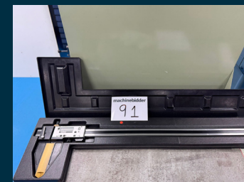
Lot 91: SYLVAC 0mm - 600mm Digital Vernier Caliper in fitted case