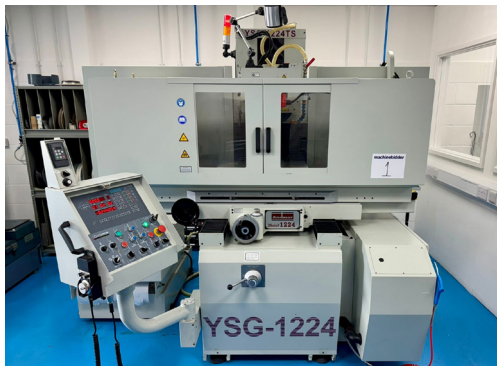
Lot 1: ANDMAR Model YSG-1224 TS CNC Precision Hydraulic Surface Grinder. Year 2022

Viewing Day is Monday 20th October between 9.30am - 3.30pm at the works at Unit 6 Holes Bay Business Park, Sterte Avenue, Poole, Dorset BH15 2AA