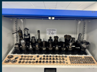
Lot 26: Qty of ISO40 Tooling & Collets (Suit Lot 3)