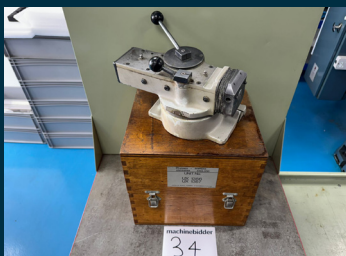
Lot 34: JONES & SHIPMAN Angular Wheel Forming Attachment