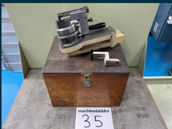
Lot 35: JONES & SHIPMAN UX8097 Cylindrical Radius Wheel Dresser