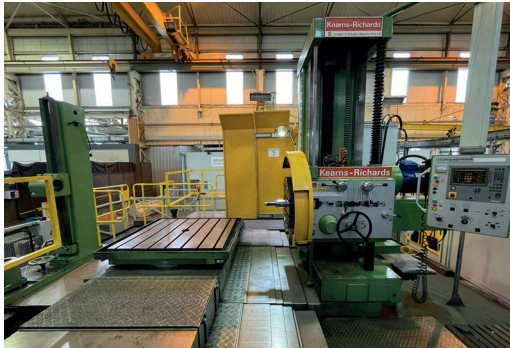
KEARNS RICHARDS SJ100 CNC Horizontal Borer with Outer Support. Heidenhain TNC 124 (Retrofitted 2014)

All visitors to the site must report to reception to sign in and have their temperatures checked prior to admittance. Personal Protective Equipment (PPE) must be worn including face masks. No minors will be allowed on the site. Descriptions and dimensions are given in good faith however these are not guaranteed and prospective purchasers are advised to check any vital information themselves. Final Prices are subject to 15% Buyers Premium. Subject to our normal Terms and Conditions of sale.