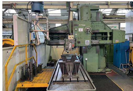
KENDAL & GENT Open Sided Planer Mill 8' x 42" x 42"