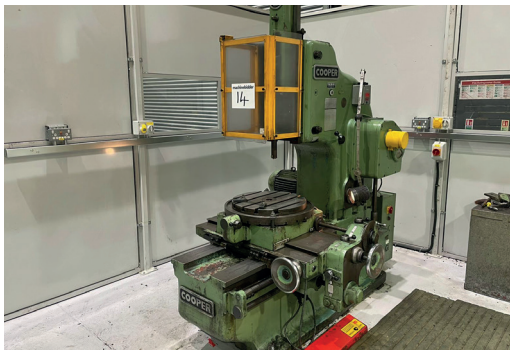
COOPER CH25 Slotting Machine with 500mm dia Rotary Table