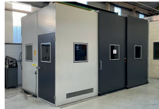
Steel Fabricated Soundproof Booth with Removable Roof. 5500mm x 2500mm x 3100mm high