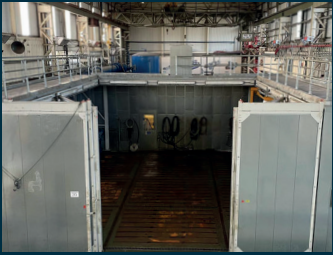
Large Steel Fabricated Test Bay with Sliding Doors and Removable Roof including contents as lotted