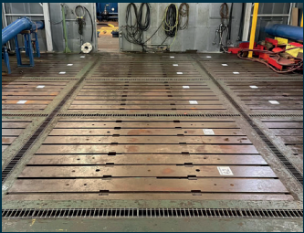
Assortment of T Slotted Bedplates 38 available