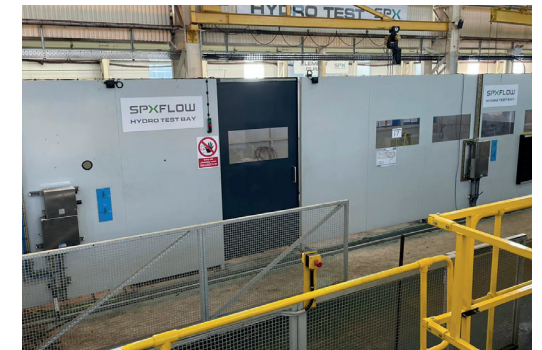
Steel Fabricated Hydro Test Bay with Sliding Doors 10900mm x 3100mm x 2600mm high