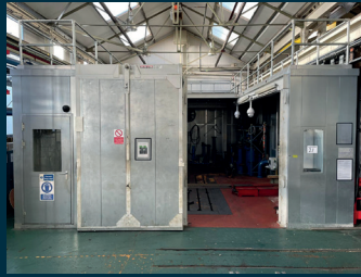
Large Steel Fabricated Test Bay with Sliding Doors and Removable Roof including contents as lotted