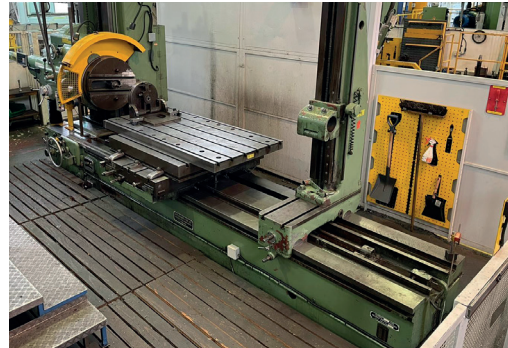
KEARNS No.3 Horizontal Borer with Outer Support