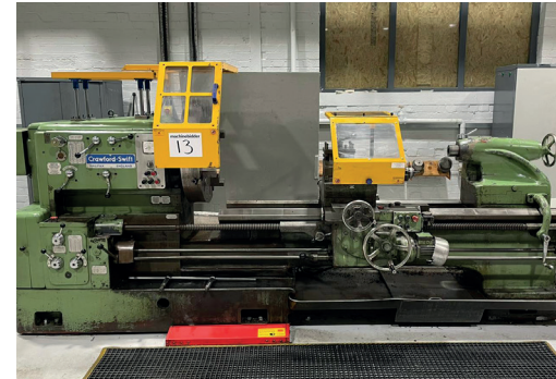
CRAWFORD SWIFT 14B x 72" between centres Double Gap Bed Lathe