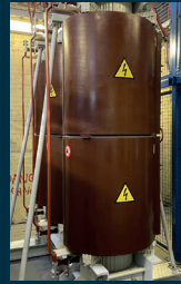
High Voltage Switchgear