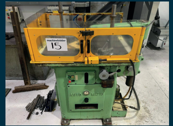
LUNN DAVIES Model 15 Keyseating Machine with Tooling