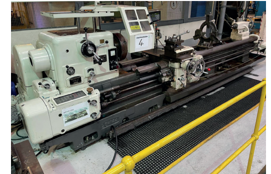
DEAN SMITH & GRACE Type 25 x 144" between centres Double Gap Bed Lathe